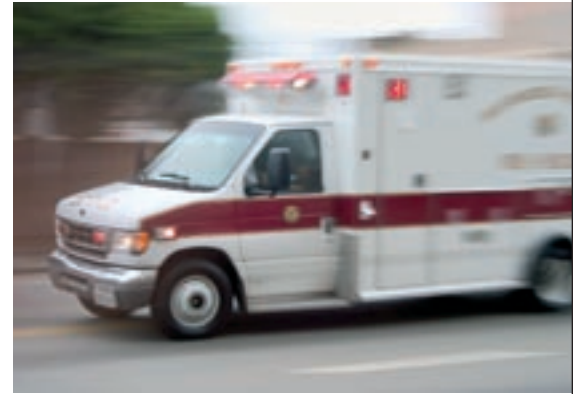
eCall accelerates rescue thanks to GPS tracking.

Car manufacturers, assistance providers, system integrators and other stakeholders are currently developing different technical solutions for eCall. PTV often delivers software solutions for GPS vehicle tracking for these applications.