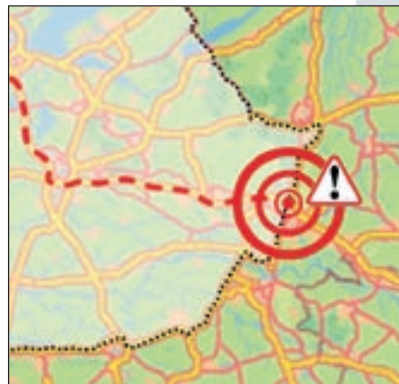
As soon as the vehicle crosses the digital fence, an alert is triggered.

GPS-based geofencing allows users to monitor vehicles and mobile assets. Rental fleet operators, for example, use geofencing to restrict the use of their vehicles to certain countries. Building and construction companies protect machinery and equipment, or transport companies protect valuable assets against theft by defining a „digital fence“ around construction sites or routes.